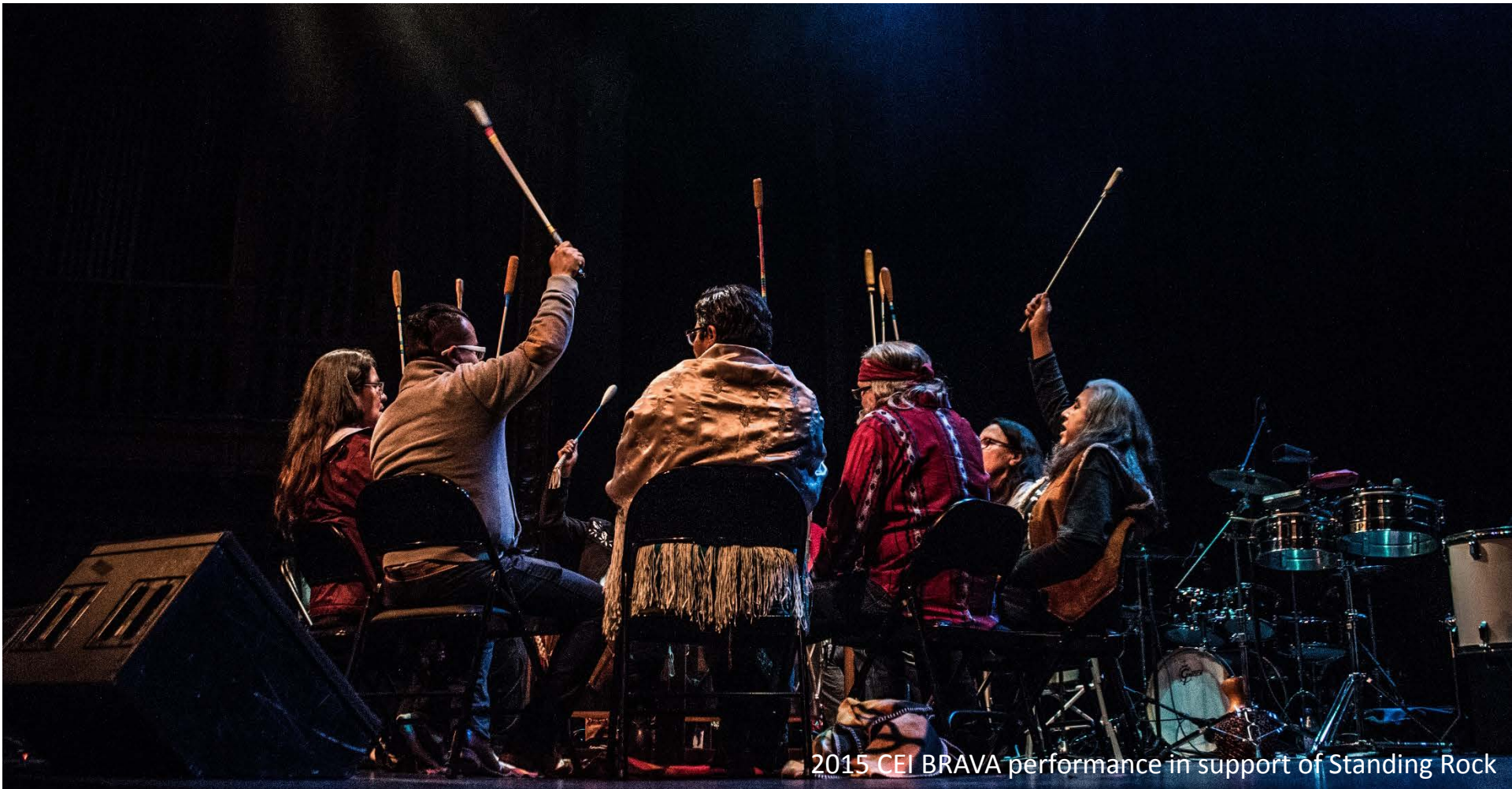
2015 CEI BRAVA performance in support of Standing Rock